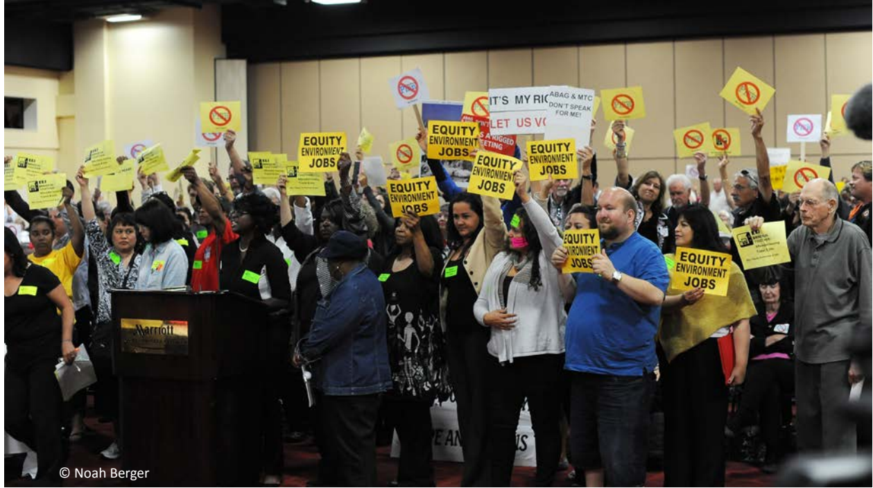
A crowd at a meeting to adopt the San Francisco Bay Area's long-range transportation and housing plan.

Comment: This section locates responsibility for public engagement expertise within an agency or municipal authority. The public engagement specialist can obtain training and expertise that he or she can share with other employees in the agency or municipal