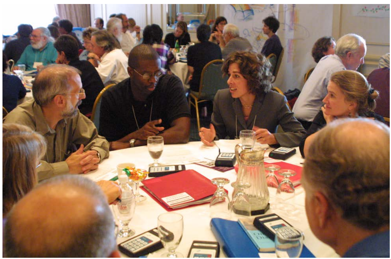
Photo taken at the 2002 National Conference on Dialogue & Deliberation.

of these formats; for example, the best applications of participatory budgeting feature a combination of large-group, small-group, and online interactions.