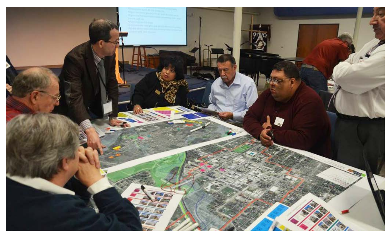
from a Sustainable Places Project event in Lockhart, TX.

Commentary: While functions such as water, sewer, utilities, ports, affordable housing, and civil service oversight may often be delegated to quasi-judicial authorities that must operate according to standard formal procedure and transparency laws, many other functions can benefit from the advice of interested, deliberating community members. Common areas of concern include: planning, development review, historic preservation, budgeting and capital improvement programs, parks and recreation, transportation, human rights and diversity, arts and culture, economic development, and neighborhoods (Barnes & Mann, 2010; Dougherty & Easton, 2011). It is important not to create boards that have authority over operational functions, as this would conflict with the executive function, whether held by a city manager or mayor.