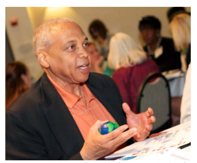
Snapshot from a National Coalition for Dialogue & Deliberation workshop.

The intent of these tools is not to offer cookie-cutter solutions for city councils and state legislatures, but to encourage them to consider their options. This would be a great help to city attorneys and other legal advisors, who often have to make recommendations without clear laws, legal precedents, or policymaker intentions.