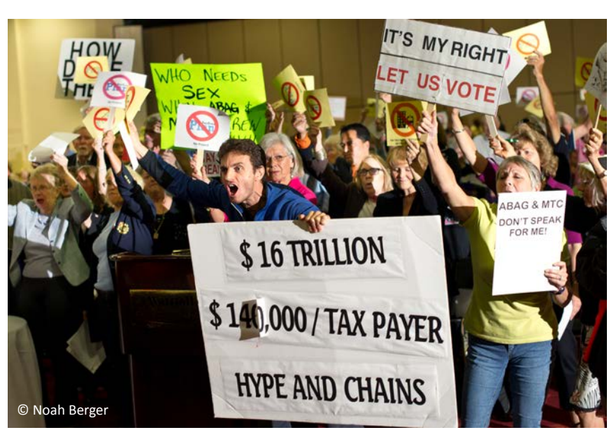
A heated and boisterous crowd at a meeting to adopt the San Francisco Bay Area's long-range transportation and housing plan.

The vast majority of public meetings are run according to a formula that hasn't changed in decades: officials and other experts present, and citizens are given three-minute increments to either ask questions or make comments. There is very little interaction or deliberation. Turnout at most public meetings is very low – local officials often refer to the handful of people who