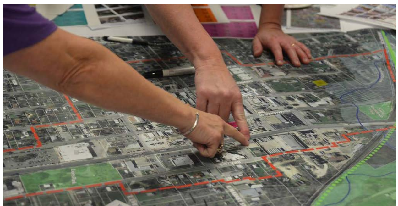
Photo by Richard Hastie from a Sustainable Places Project event in Lockhart, TX.

In short, the legal infrastructure to support broader and more deliberative and innovative local direct public engagement is problematic. Although sometimes prompted and authorized by law to involve the general public in their work, local governments often seek compliance with the explicit minimal standards for participation instead of examining law to identify their broader implied authority. Local governments have rarely institutionalized (meaning made permanent through ordinance, resolution, or formal policy) new systems of more fully democratic participation at the local level. A few exceptions exist. For instance, some large cities (e.g., Los Angeles, California; Portland, Oregon; Minneapolis, Minnesota) and small cities (e.g., Dayton, Ohio) have created and funded permanent structures, such as neighborhood councils or community boards, that have an official or semi-official role in local decision making; however, these tend to be representative bodies, rather than democratic, empowered ones (Leighninger 2006, 2012). Despite the limited legal infrastructure for public participation in local government, the number of people initiating, organizing, facilitating, and researching direct public engagement is growing.