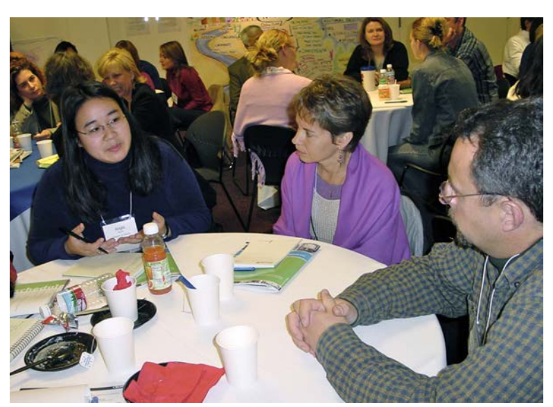
From the 2004 National Conference on Dialogue & Deliberation.

Citizen Advisory Bodies shall be formed according to guidance in this charter through municipal ordinance enacted by the governing body.