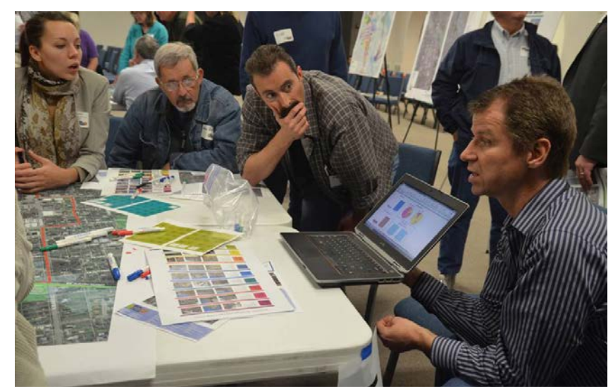
at a Sustainable Places Project event in Lockhart, TX.

interact with sustained networks of citizens. And online tools have been established that allow people powerful and convenient ways to report problems, generate and rank ideas, work in small action teams, and visualize options for public budgeting and land use planning. Many of these efforts have been initiated by people and groups outside government, from community foundations to neighborhood organizers to universities to Chambers of Commerce. But whether or not they are led by public officials, most of