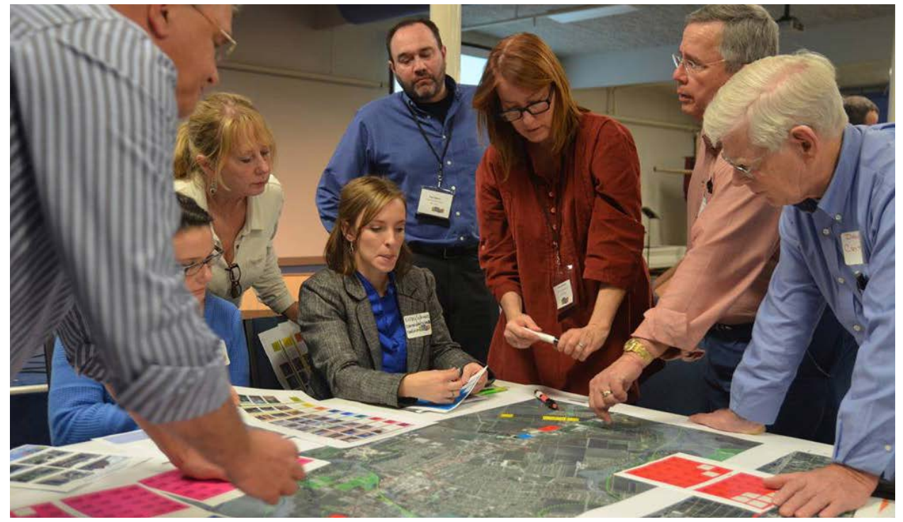
from a Sustainable Places Project event in Lockhart, TX.